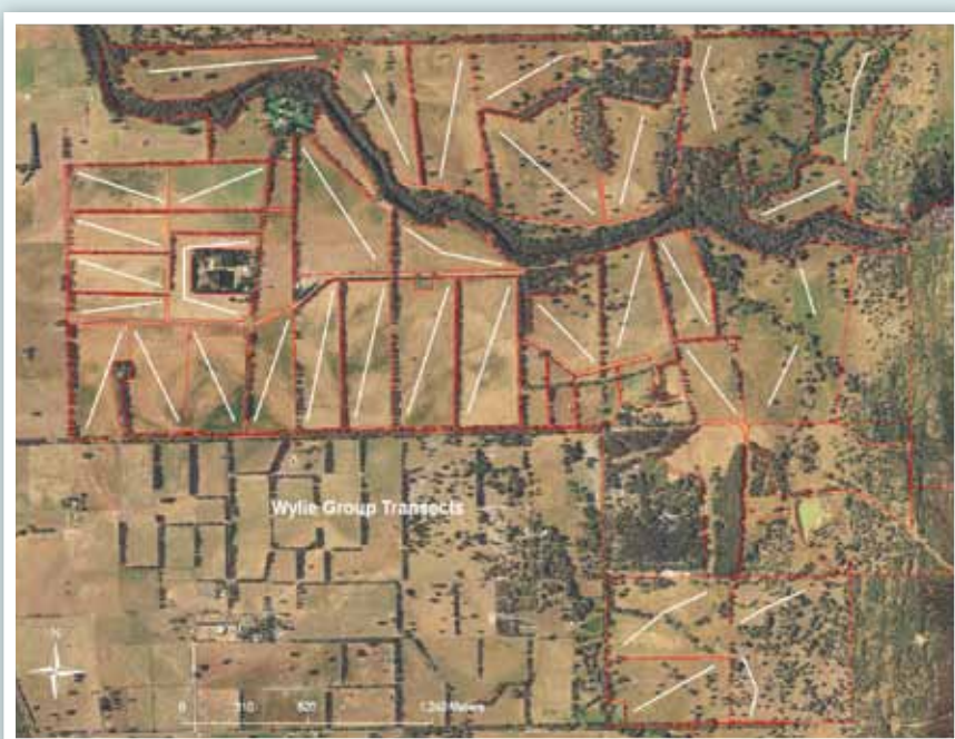
ABOVE - FIGURE 1: Murray River Farms - paddocks showing transects Red line = paddock boundary White line = diagonal transect of soil sampling.

The soil analysis for each paddock was developed into traffic light maps for Phosphorus (P) at 80%, 85%, 90% and 95% production levels. 100% production occurs when the soil is optimally fertilised, where pH is optimum, where the most productive sward is grown, where weeds are controlled, where stocking rate is at the maximum, etc. Beef enterprises tend to run at 80 – 85% of the total pasture potential.