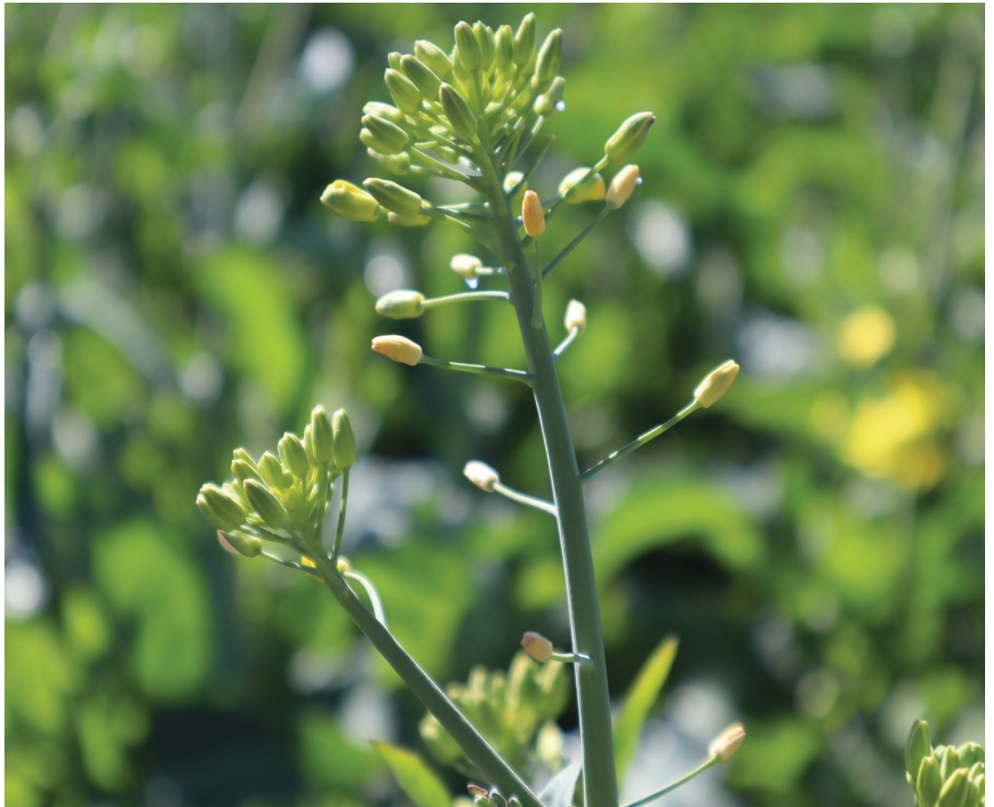
Figure 1 Bud discoloration in canola after a frost event.

Bud discoloration occurs after frost stress in canola i.e. buds change colour from green to creamish white (Figure 1).