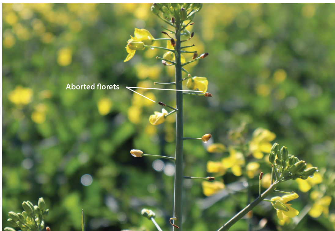
Figure 2 Frost damage symptoms in canola at early flowering stage.