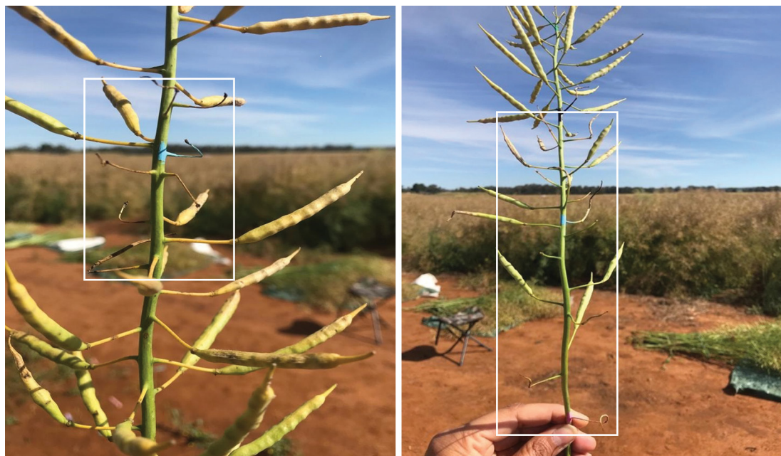
Figure 3 Pod abortion in two canola varieties evident at maturity.

Frost at pod set results in abortion and death of developing seed (Figure 3). This can cause gaps in pod set and twisting of the inflorescence. The frosted pod surface can turn yellow/green and/or develop a pale blistered surface.