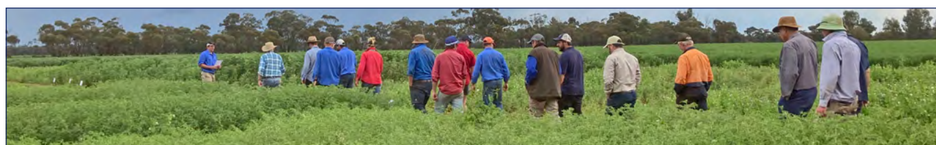
Chickpeas produced excellent biomass, seen here at the field day, 18 October 2022