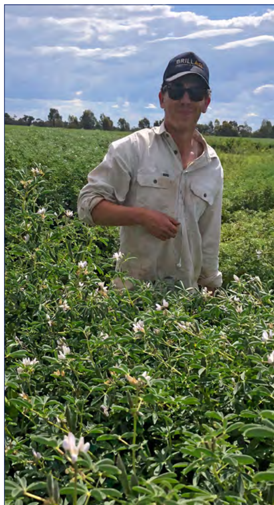
Albus lupins, November 2022