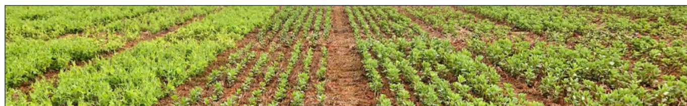
Field peas (left) and faba beans had great early vigour