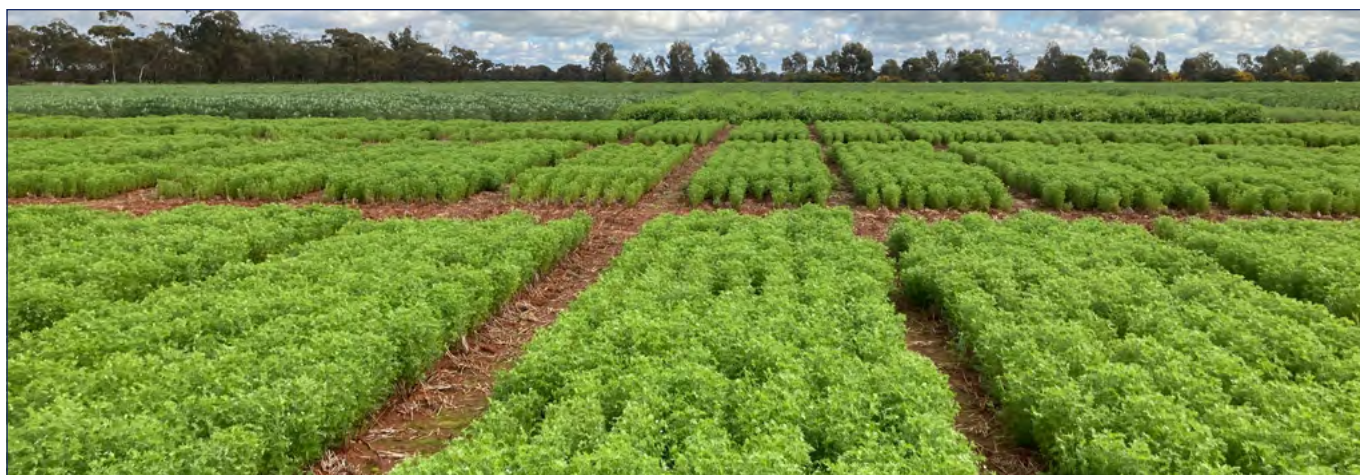
Barellan pulse trial site, 31 August 2022