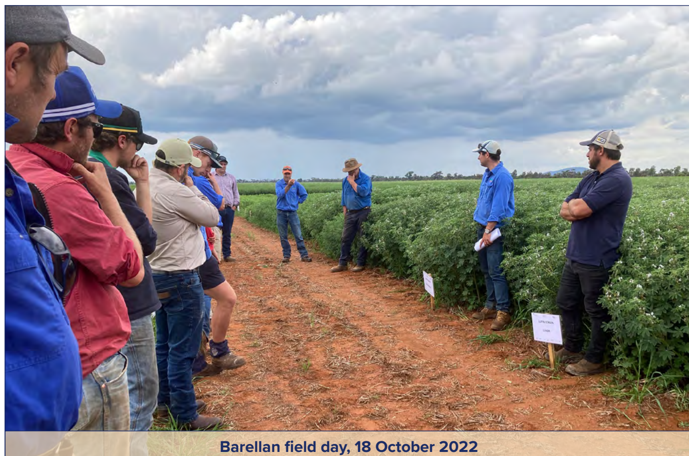
Barellan field day, 18 October 2022