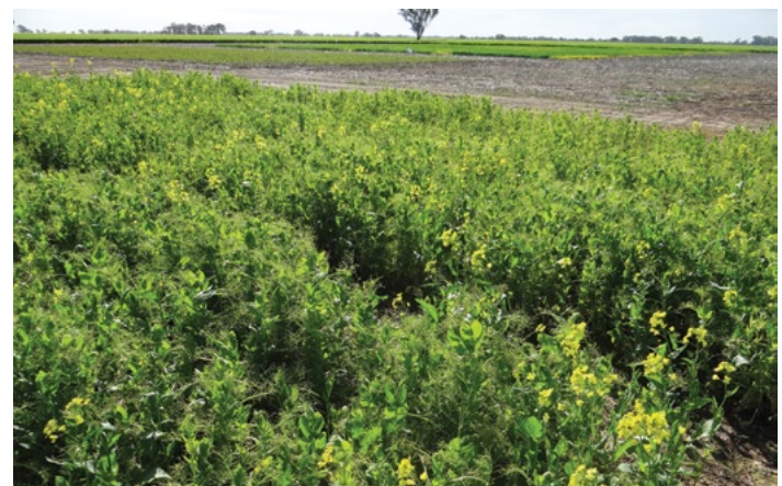
Peola (peas and canola) sown together in the maximum diversity plot (Photo taken 2 September 2020).

On 28 January 2021, summer cover crops were sown into the same plots as the 2020 summer cover crops. The same mixes were used during 2021 as during 2020; these