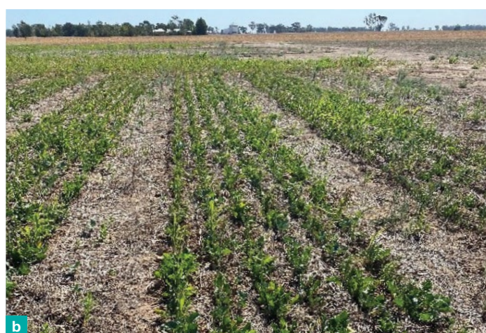
Cover crop treatments before being sprayed out with glyphosate on 1 April, 2021. a) Cover crop mix 1; b) Cover crop mix 2 at Burramine, Victoria.