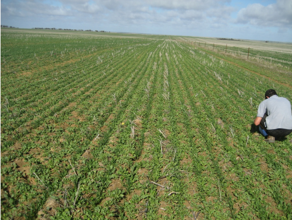
Figure 1: Site at application 13/7/10

Coverage issues and the seasonal conditions prior to application, coupled with ongoing dry and stressed conditions following application, have contributed to lower than expected wild radish control from all treatments in this trial.