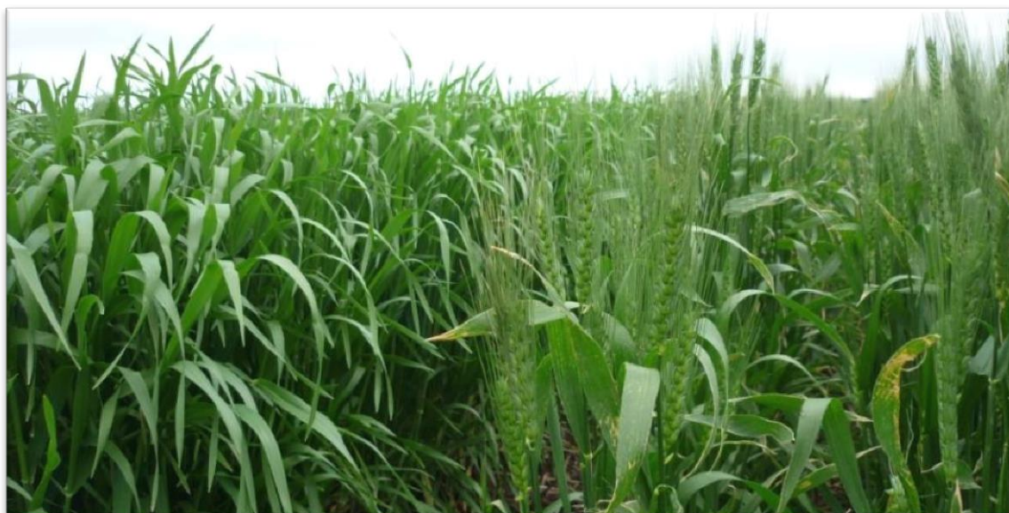
Photo: Compass (left) and RAC1843 (right). Photo taken 14 th July 2014 at Hart.

The Hart Field-Site Group acknowledges the CSIRO contribution to this experiment funded by GRDC project CSP00178.