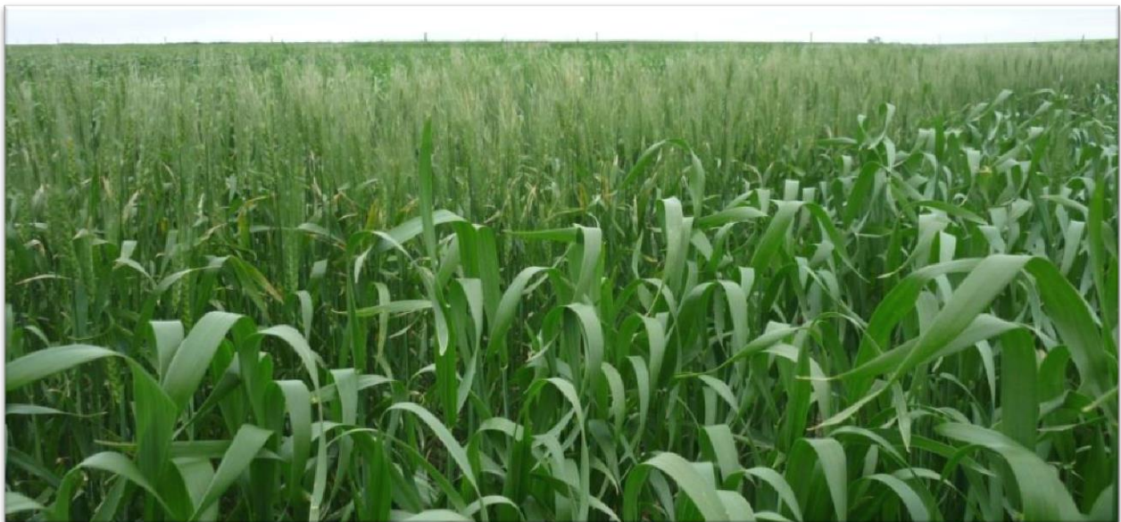
Photo: RAC1843 (left) and Mace (right). Photo taken 14 th July 2014 at Hart.