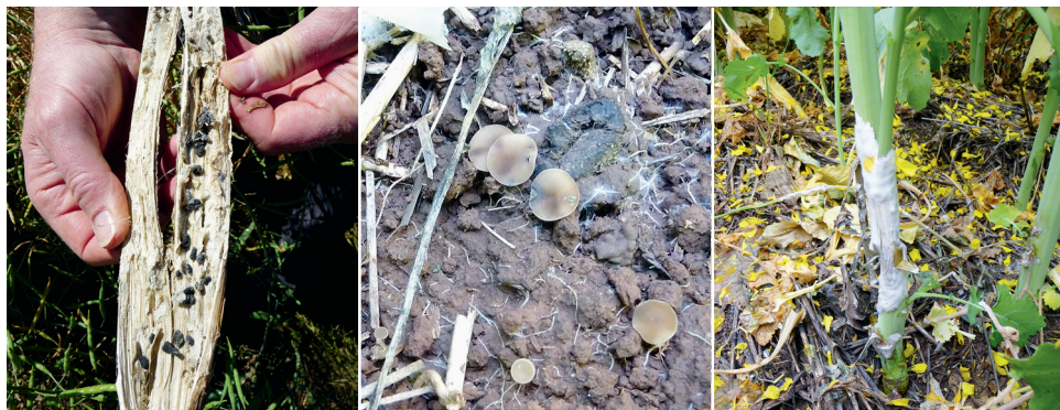
Photo 1: Sclerotia form inside the stems of canola plants and can become mixed with harvested canola seed, as well as being incorporated into crop stubbles and soil.