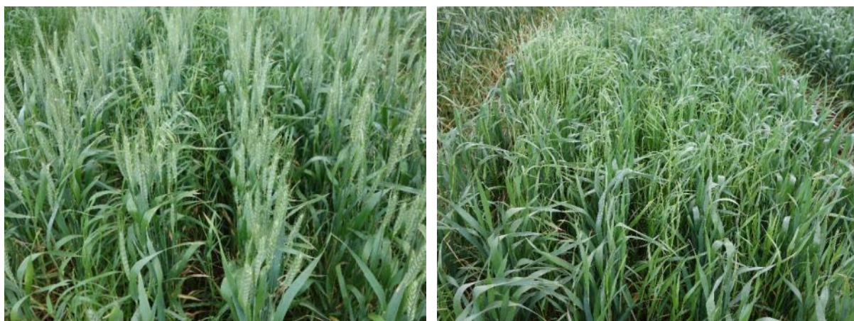
Photos: Nil herbicide applied to (left) first time of sowing (right) second time of sowing, taken on 17 th September.

As reflected by the grain yield, the second time of sowing produced a smaller and less competitive wheat crop. In the photos below we can see in the early ToS the ryegrass height is lower and not sitting in the crop canopy. In comparison the second ToS the ryegrass is much taller and sitting higher in the crop canopy as the wheat crop was less competitive.