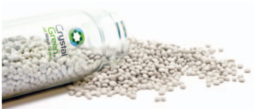
CRYSTAL GREEN IS A DURABLE, DUST-FREE, WHITE STRUVITE GRANULE WITH CHARACTERISTICS THAT MAKE IT WELL SUITED TO USE IN MODERN SEEDING MACHINES.

CG is also intrinsically slow-release, remaining plant-available for 160 to 200 days (2) . Struvite is not easily dissolved in water but is highly citrate-soluble. Consequently, dissolution of struvite is plant-activated, with the granules