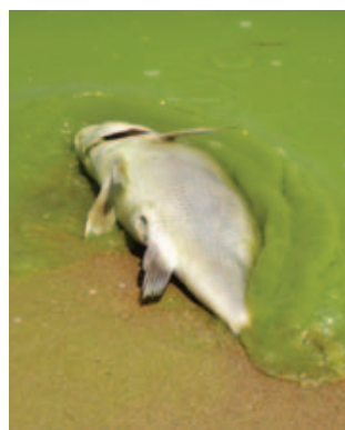
THE RAPID GROWTH OF ALGAE DUE TO EXCESSIVE NUTRIENTS IN THE ENVIRONMENT DEPLETES THE WATER OF DISSOLVED OXYGEN, LEAVING FISH AND OTHER AQUATIC LIFE TO EFFECTIVELY SUFFOCATE.