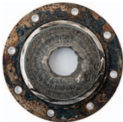
THE BUILD-UP OF PHOSPHATE SALTS IN PIPES AT WASTEWATER TREATMENT FACILITIES IS AN ISSUE FOR PLANT CAPACITY AND MAINTENANCE.

In addition, the wastewater treatment facility earns revenue sales of the CG produced.