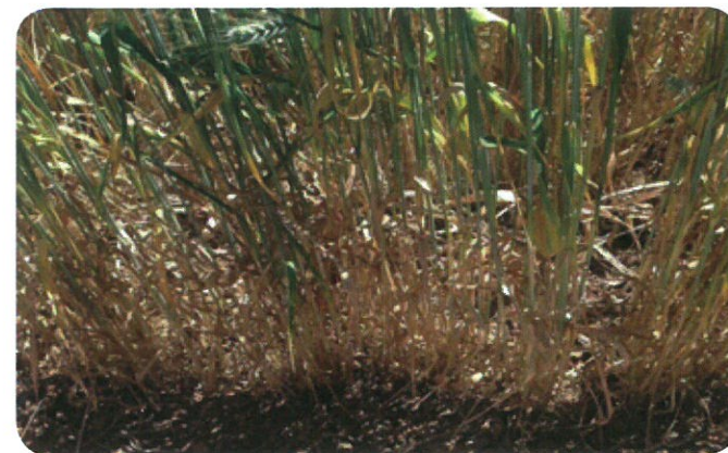
Photos 2 and 3: Figure 2: Patchy Establishment. (LHS – ungrazed Disc, RHS – ungrazed Tyne)

Examination of the biomass production between the treatments was not conducted with NDVI satellite imagery, as it was in the previous year. Visually however, the trend of the disc seeded plots showing lower early biomass production from emergence through to late tillering was evident. Again, as per the long term trend at this point on, the crop development evened up.