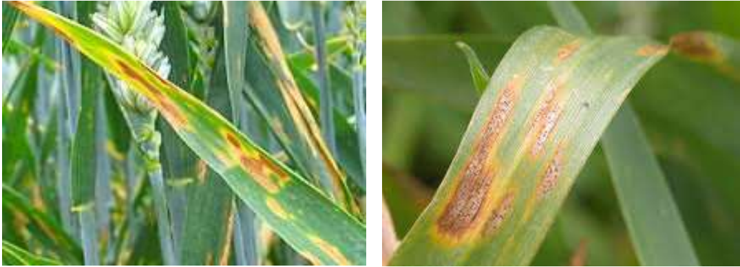
diagnostic feature of Septoria tritici blotch.

Septoria tritici blotch. The presence of black fruiting bodies within the blotches is a