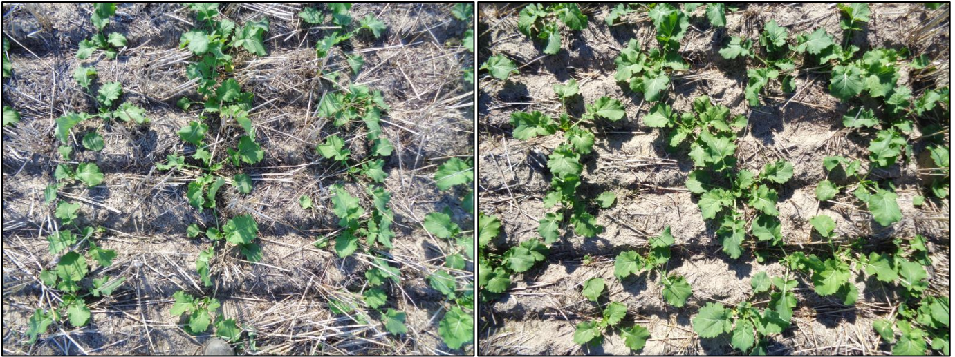
Figure 3. 10 plants/m 2 handed thinned to even spacing (left) and uneven spacing (right) at Wongan Hills.