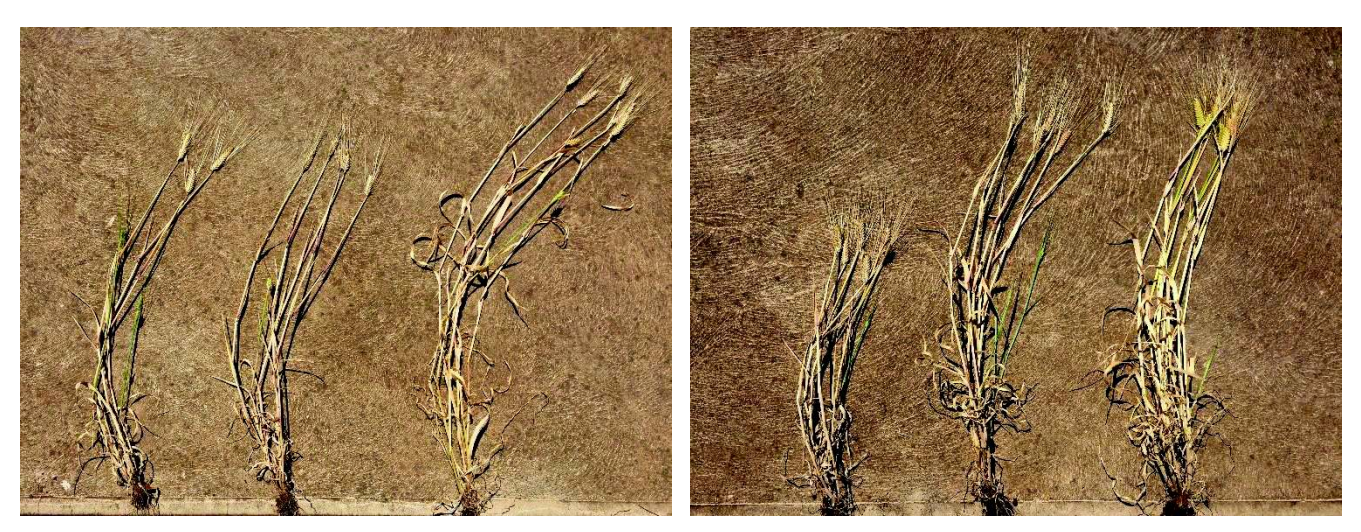
Figure 2. Compass barley plants treated with PGR (right) and control treatment (left) both treatments spread with urea at 0 kg N/ha, 40 kg N/ha and 80 kg N/ha (L-R in each photo).