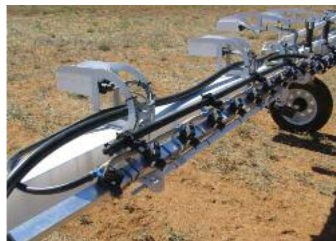
WEEDit spray bar, sensors on the left and nozzles on the right.

spectrum weed control for summer weed and fallow weed control. This type of sprayer is widely accepted in broad-acre cropping situations.